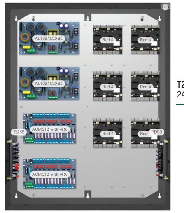
T2PDK7724S 24-Door Access System with Power

Trove 1 Series - Accommodates Altronix Power and Distribution with Controllers TROVE1PD1 N/A Enclosure + Backplane 8-Doors TPD1 Backplane only N/A Trove 1 Series Pre-assembled Kits T1PDK7M8 AL1024ULXB2 MM8 Mounting Magnets 8-Doors Trove 2 Series - Accommodates Altronix Power and Distribution with Controllers TROVE2PD2 Enclosure + Backplane N/A PDK 24-Doors TPD2 N/A Backplane only Red Boards Trove 2 Series Pre-assembled Kits Red1, T2PDK7516S AL1012ULXB, AL1024ULXB2 Red2, 2-ACMS8, 2-VR6, PD8UL T2PDK75F16S eFlow102NB, eFlow104NB Red4 16-Doors T2PDK7516SD AL1012ULXB, AL1024ULXB2 2-ACMS8CB, 2-VR6, PD8ULCB T2PDK75F16SD eFlow102NB, eFlow104NB T2PDK7724S 2-AL1024ULXB2 2-ACMS12, 2-VR6, 2-PDS8 T2PDK77F24S 2-eFlow104NB 24-Doors T2PDK7724SD 2-AL1024ULXB2 2-ACMS12CB, 2-VR6, 2-PDS8CB T2PDK77F24SD 2-eFlow104NB